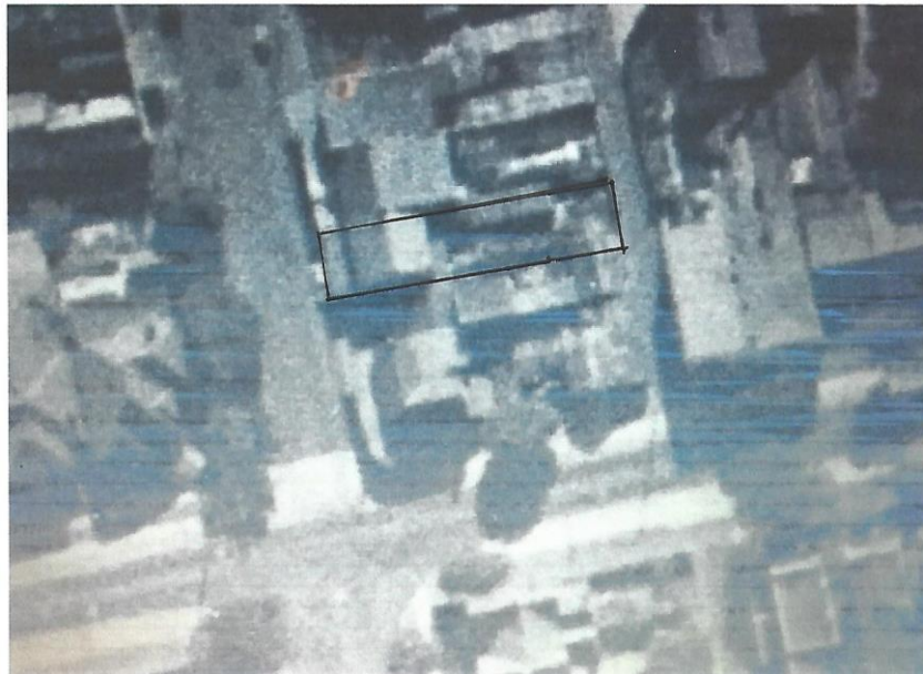
Photo 1. Development in Ocean St. / Queen St. 1943