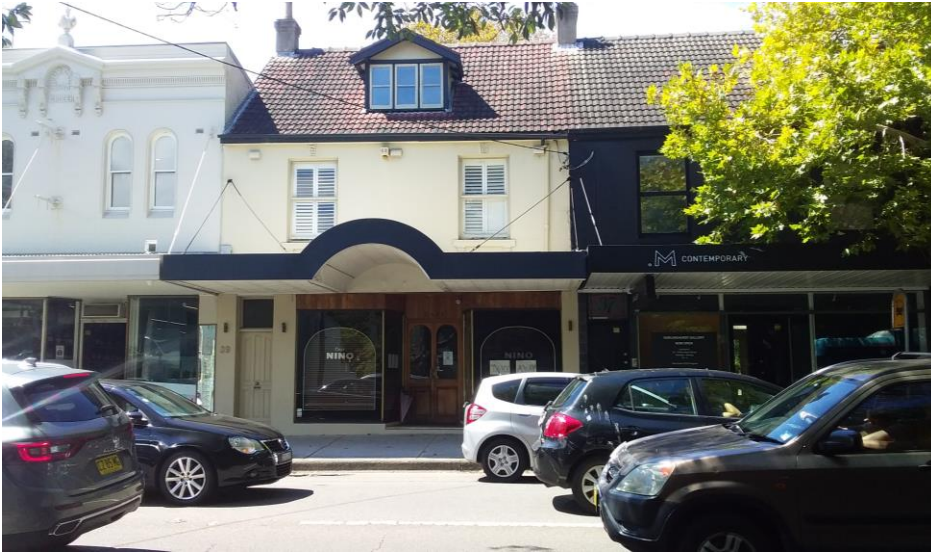
Photo 2. Ocean Street, east side, Street elevation: L to R Number 41, 39 and 37