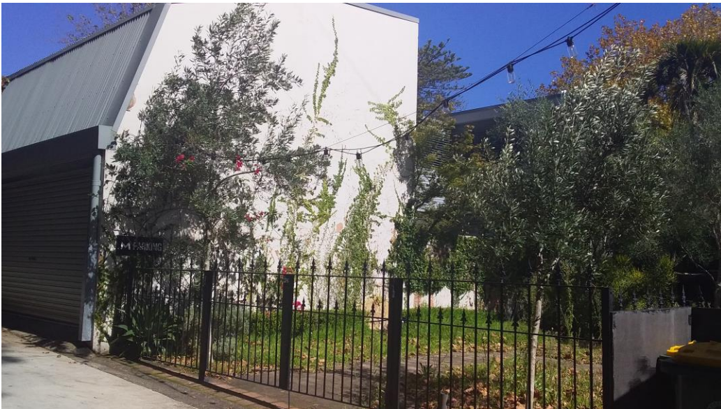
Photo 6. Rear of number 37 Ocean St. from Kilminster Lane. Wall on boundary of garage to number 35 beyond.

Kilminster Lane is a 'service lane - narrow street', extending from Forth St., crossing Queen St. and terminating at a 'dead end' to the south behind Ocean St.. The rear of number 37 is an open paved area which has been planted with four Olive trees to create a formal open space, which is utilised as a carpark area. There is a new steel 'heritage' steel fence to the lane. On the south side of the site at number 35 there is a garage structure with roller door to the lane and first floor above with a steep roof to the lane.. Other properties along the lane present concrete hard stand at number 39 and garages and cottages north.