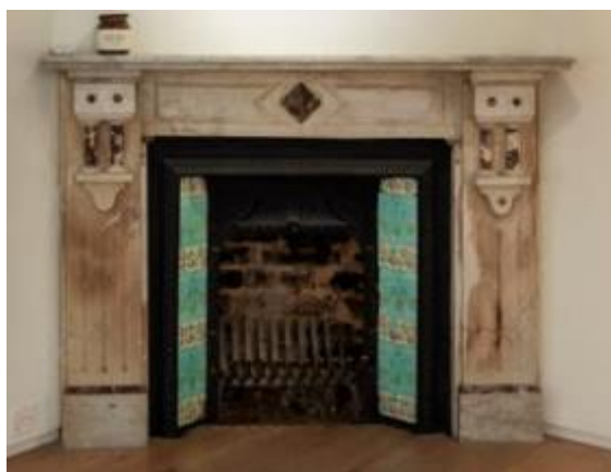
Photo 5. Marble Fire surround

Number 37 is one of a pair of two storey Late Victorian shop houses. At ground level there is a frameless glass shopfront with a central timber framed pair of doors, with a single entry door accessing the level above, on the northern side of the shopfront. There are two circular metal columns either side of the front door which support the first floor above. The wall surface surrounding the glass is treated with black slate tiles. None of these architectural elements are original. Originally the shop windows were probably in the order of 3m wide set into a masonry wall. There is an original multi-paned window to the rear. Internally there are no original features except the marble fire surround in the 'reception' room on the ground floor.