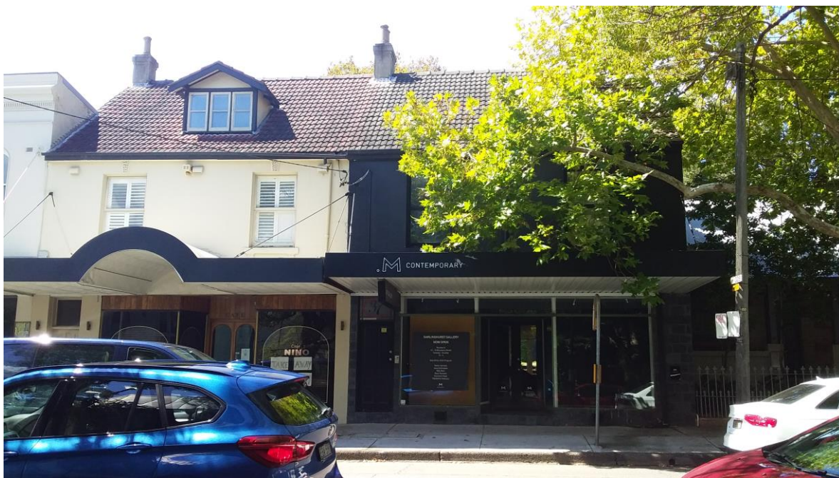
Photo 4. Number 35 and 37 Ocean St. Woollahra

Number 37 is one of a pair of two storey Late Victorian shop houses. At ground level there is a frameless glass shopfront with a central timber framed pair of doors, with a single entry door accessing the level above, on the northern side of the shopfront. There are two circular metal columns either side of the front door which support the first floor above. The wall surface surrounding the glass is treated with black slate tiles. None of these architectural elements are original. Originally the shop windows were probably in the order of 3m wide set into a masonry wall. There is an original multi-paned window to the rear. Internally there are no original features except the marble fire surround in the 'reception' room on the ground floor.